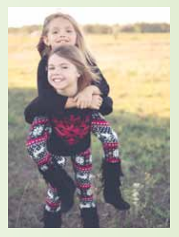
Page 3 - Volume 2018 - No. 1

A SPECIAL THANK YOU FROM ALL OF US TO ALL OF YOU. TIPTON CHILDREN'S HOME HAD A GREAT CHRISTMAS. WE THANK YOU FOR THE CARDS, GIFTS, AND FINANCIAL ASSISTANCE DURING THIS TIME. IT IS ONLY WITH THE HELP OF MANY FRIENDS AND FAMILY MEMBERS THAT OUR CHRISTMAS SEASON IS SO BRIGHT. THANK YOU FOR EVERYTHING, ESPECIALLY THE PRAYERS DURING THE HOLIDAYS!