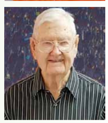
Page 2 - Volume 2018 - No. 1